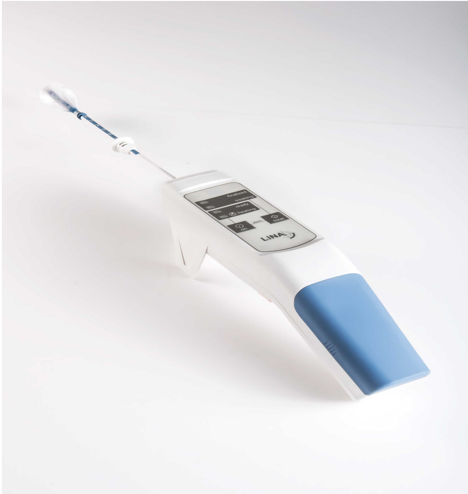
Figure 1: Librata endometrial ablation device

The Librata endometrial ablation device is a novel handheld, battery operated ablation device using heated glycine within a silicone balloon.